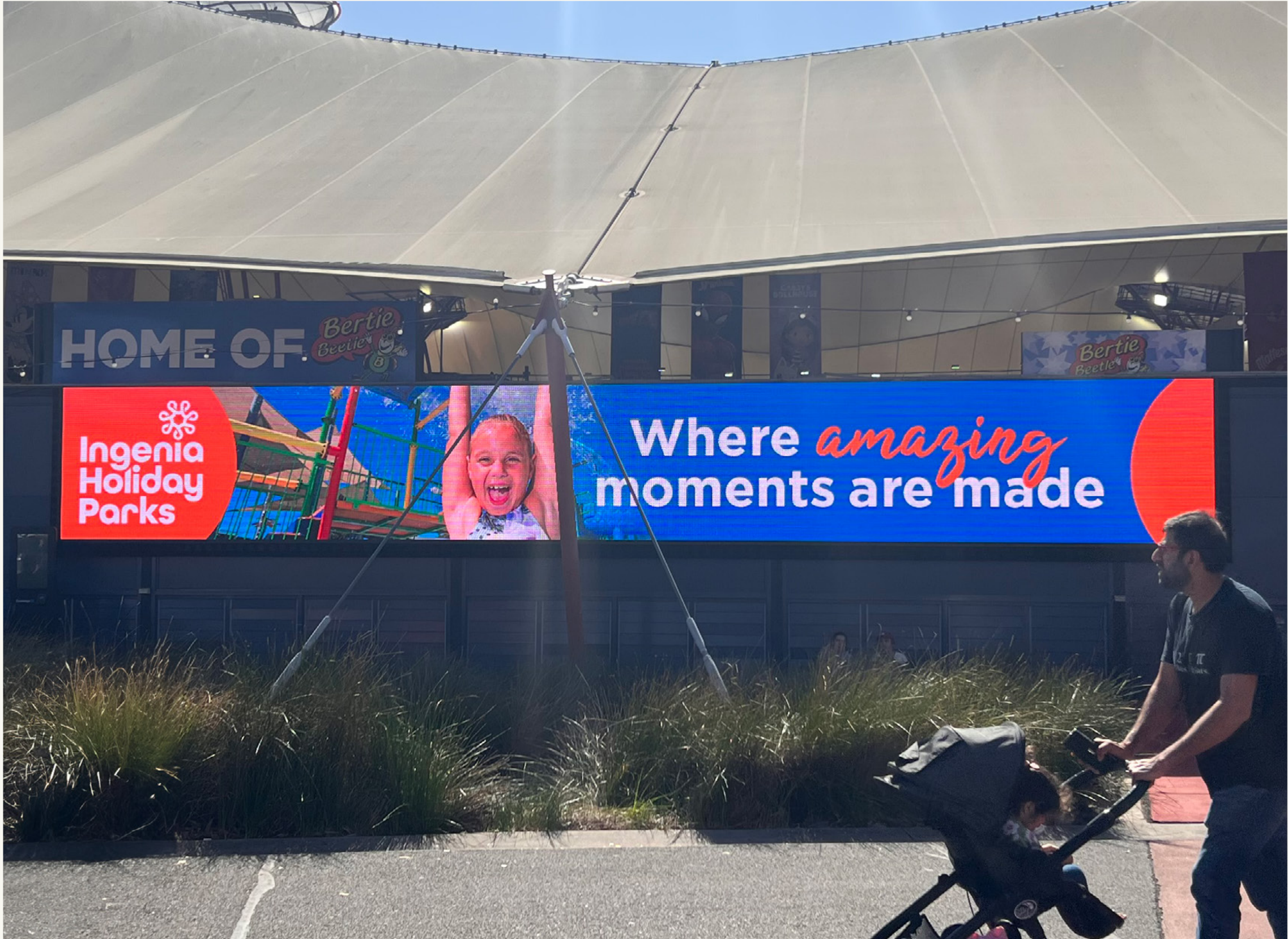
GRAND PAVILION DISPLAY