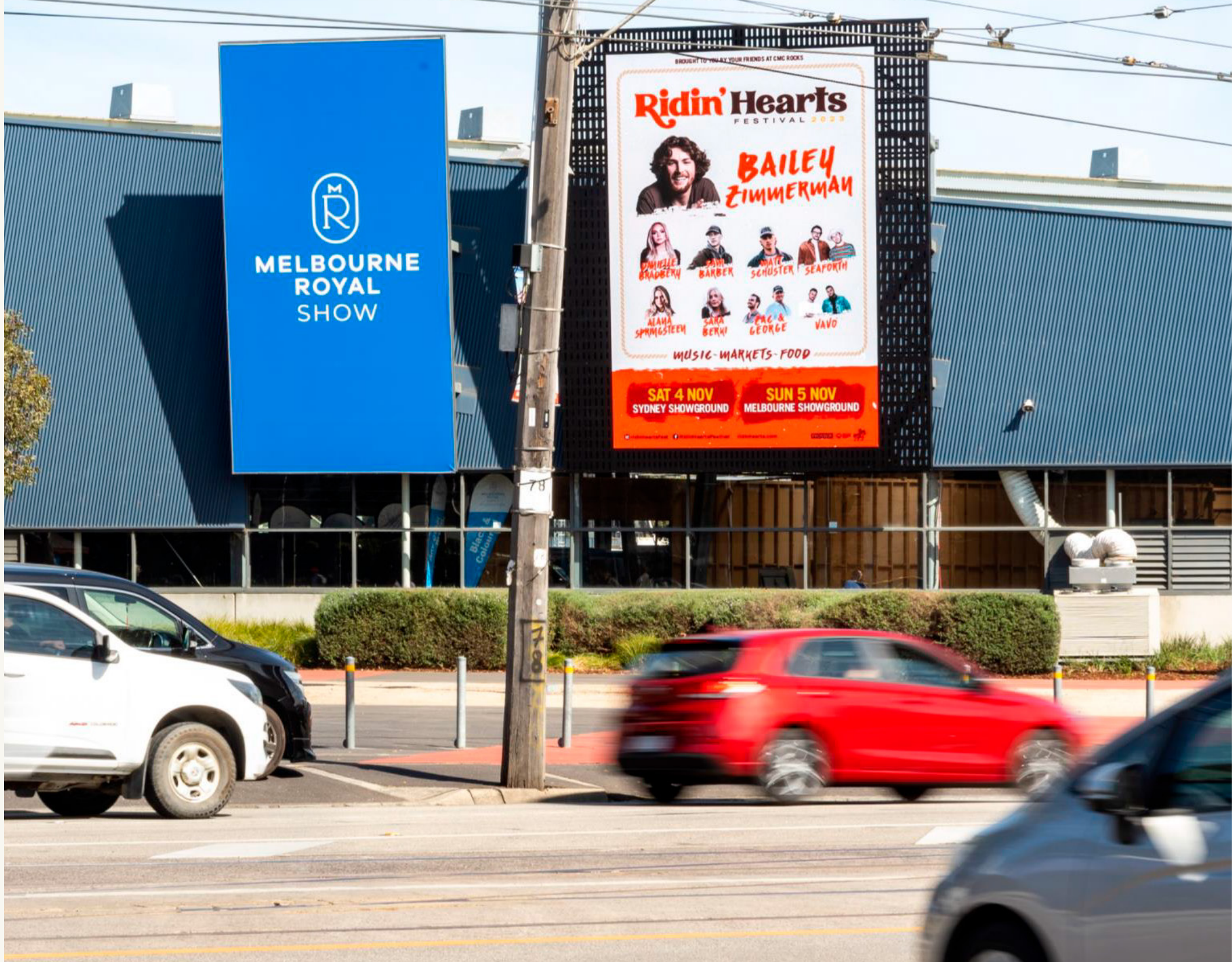
EAST - 5.1m x 7.7m, facing Epsom Road

Operating 6am-11pm daily, 20,000 passing cars per day (source: VicRoads)