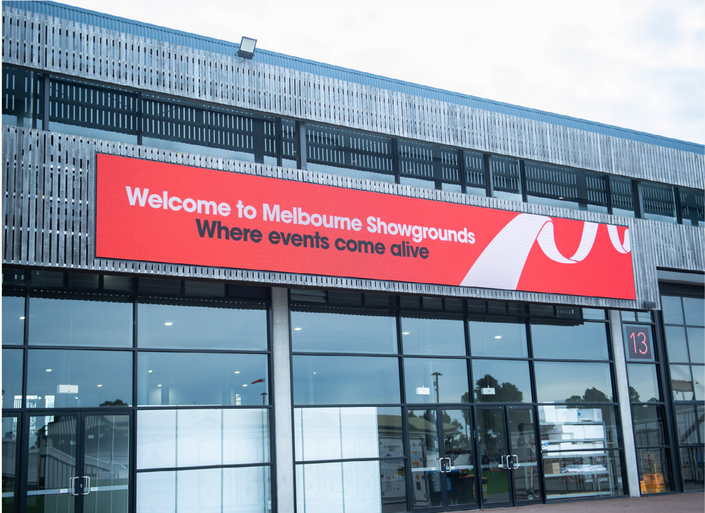
MELBOURNE ROYAL CENTRE DISPLAY