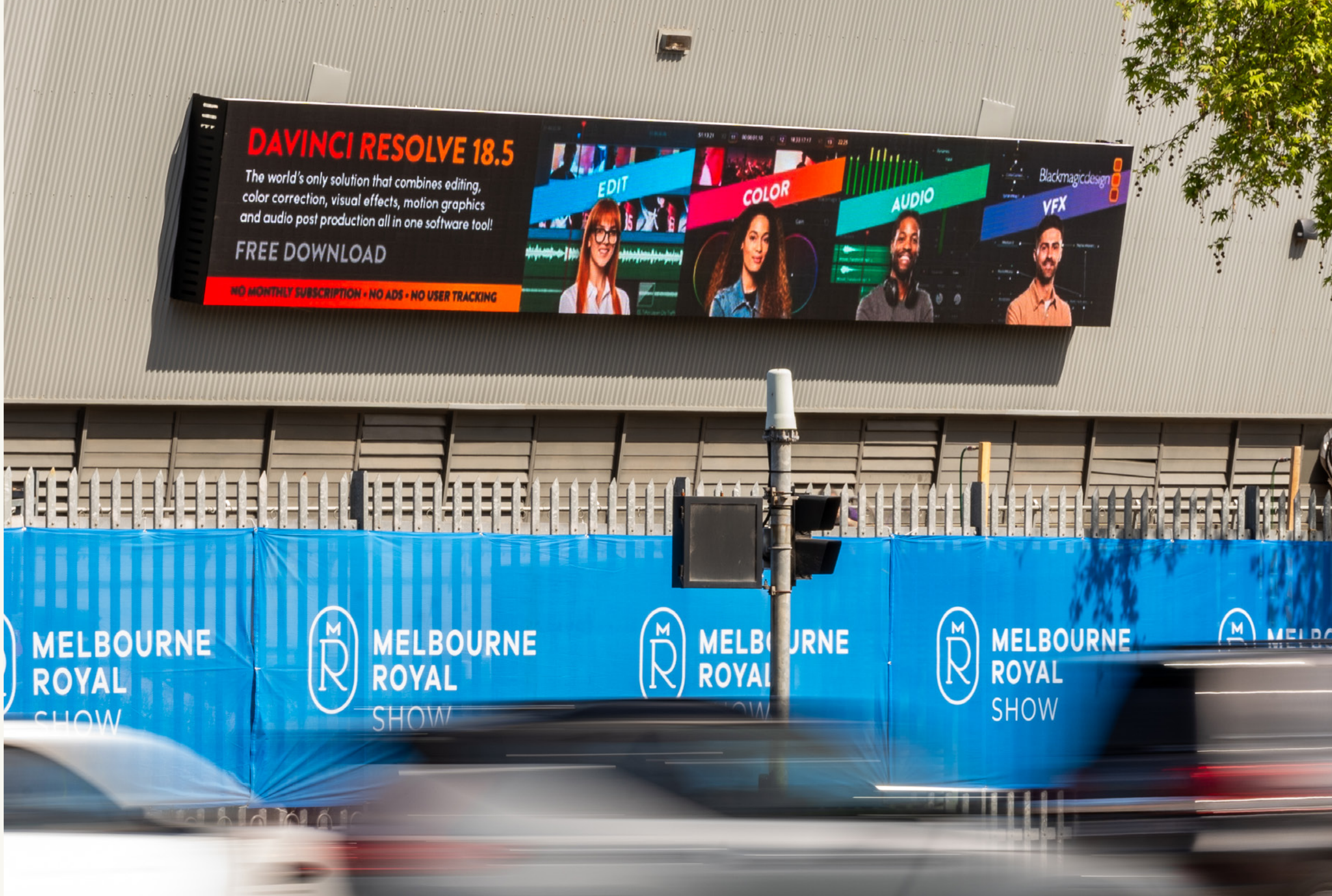
NORTH - 14 m x 1.9 m, facing Epsom Road